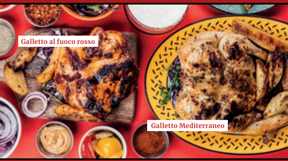
Galletto al fuoco rosso