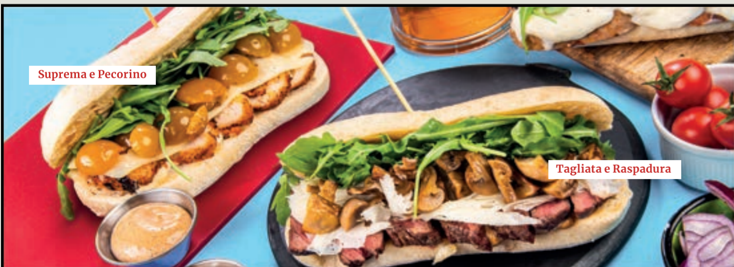
Suprema e Pecorino