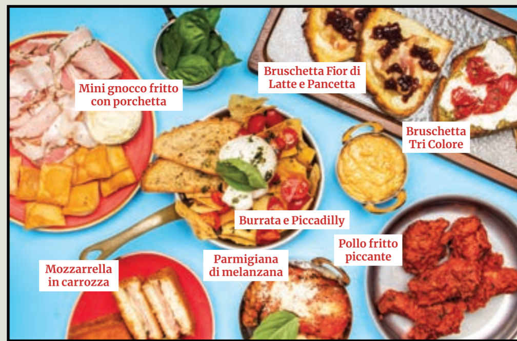
Mini gnocco fritto con porchetta

Focaccia with garlic, extra virgin olive oil and Fior di Latte mozzarella.