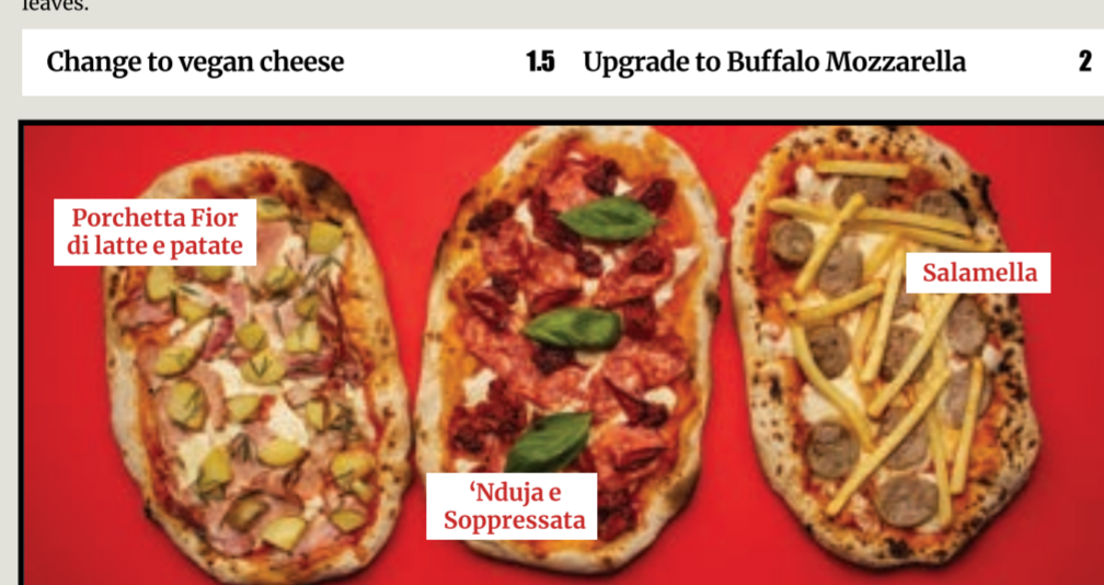
Porchetta Fior di latte e patate

Change to vegan cheese 15 Upgrade to Buffalo Mozzarella 2