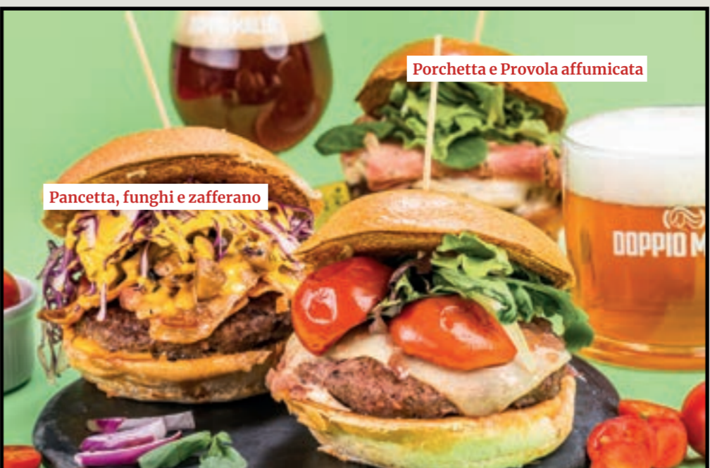
Pancetta, funghi e zafferano